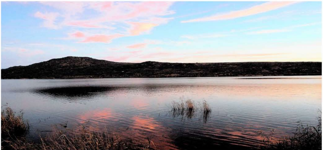
Verlorenvlei, near Elands Bay on the West Coast, is a twitcher's paradise and one of the best spots for water birds in the province.