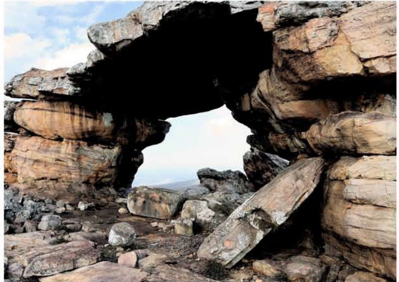
Vensterklip is an eerily magnetic formation on the West Coast.