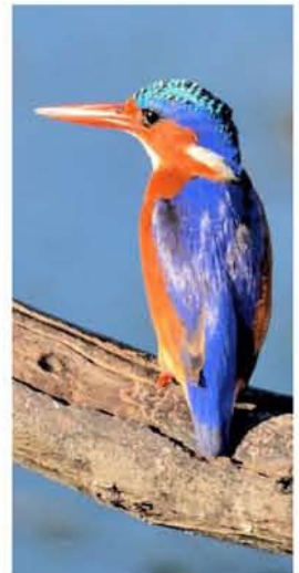
A Malachite kingfisher perches.

Gerald and JD also have a sharp and subtle eye for marketing: the most photographed aspect of the manor is the bird-table adjacent to the breakfast room. They put a fresh half-apple on it every morning and down comes one of the resident