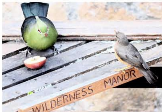
Not often you see a Knysna Loerie (left) this up close and personal.

You'll also need the car to get to the Malachite Bird Hide, which is