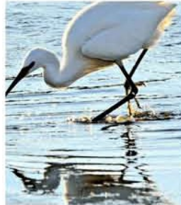
An egret looks for dinner.