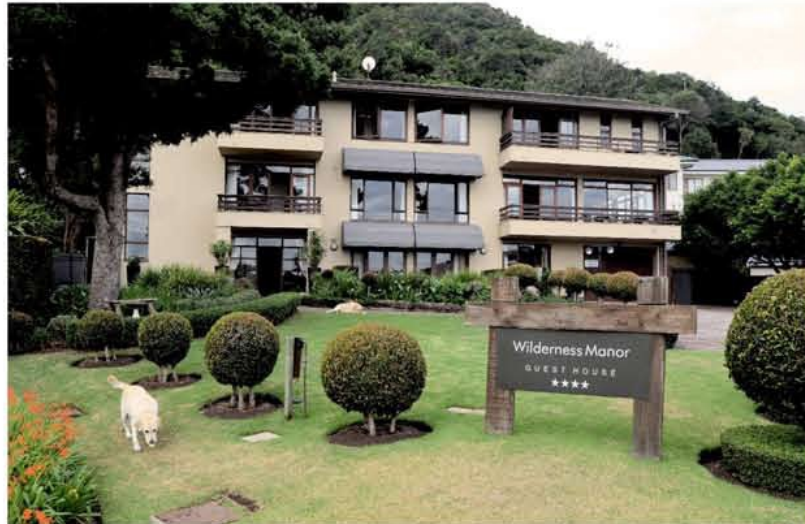
Wilderness Manor is rated as one of the top establishments in its category in the country.