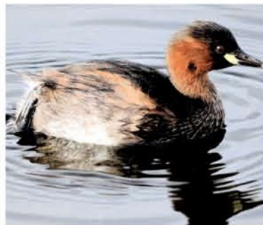
A dabchick (above left) dabs, while Venterklip's Tin Kitchen (right) lures the hungry.